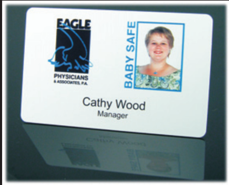
Photo ID Badge Photos can be submitted as Jpeg or BMP, sent via e-mail or on disk.

Additional Notes: No white imprint. PMS process color matching available (VECTOR ART ONLY). Exact PMS match cannot be guaranteed. Flood coats available $1.65© each. (1"x3", 1.5"x3" and Oval only) No charge for additional colors. Second side imprint available for $1.00(c) per badge. Ask about our Release Programs and order as few as one badge at a time! Minimum of 25 pieces on each new release program.